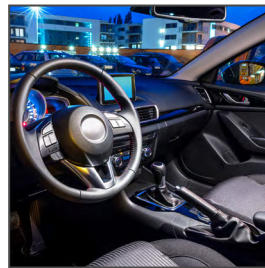
Automotive Interior Lighting