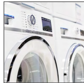
Washers and Dryers